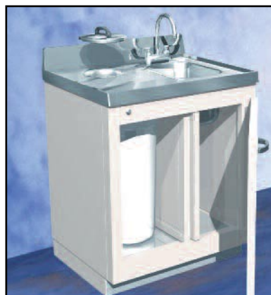
Two sections for hot and cold waste

T he Sink and Waste Cabinet performs three functions. A stainless steel sink allows the convenience of running water in the hot lab. The space under the sink is used for cold storage. Separated from the sink section by a lead barrier, the waste section includes a shielded port that allows waste to be dropped into a polyethylene container for storage until decayed.