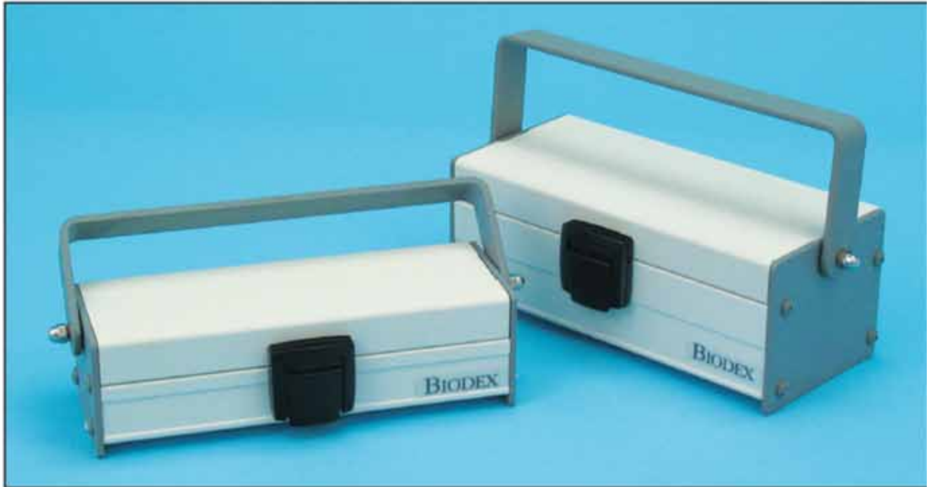
Shielded Syringe Carriers, small and large

Two sizes, each offered in .125" and .25" lead shielding for added protection